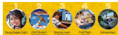
Young Eagles® 5 Step Plan

May 17 June 28 August 23 September 27 October 25