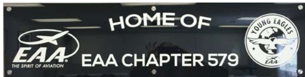
This sign is now in SimplyFly's Training Room